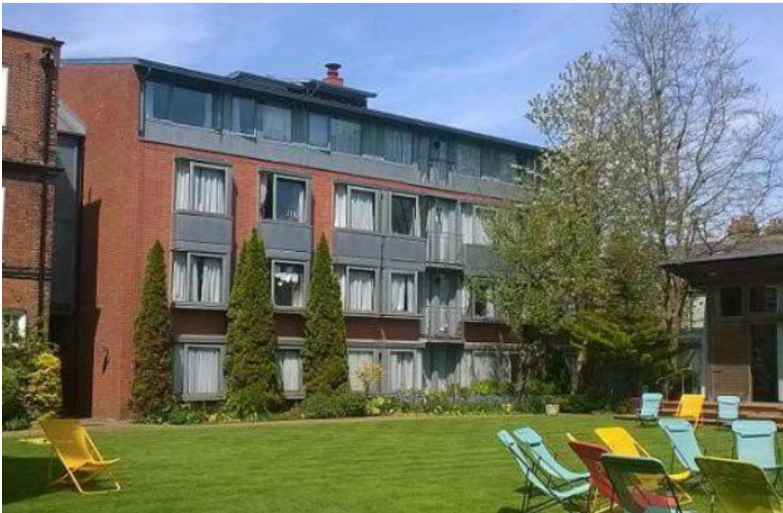
Centenary Building's south front, view from the back lawn

Centenary Building also houses the College's guest rooms for visitors (All rooms are 'on-site band B'.)