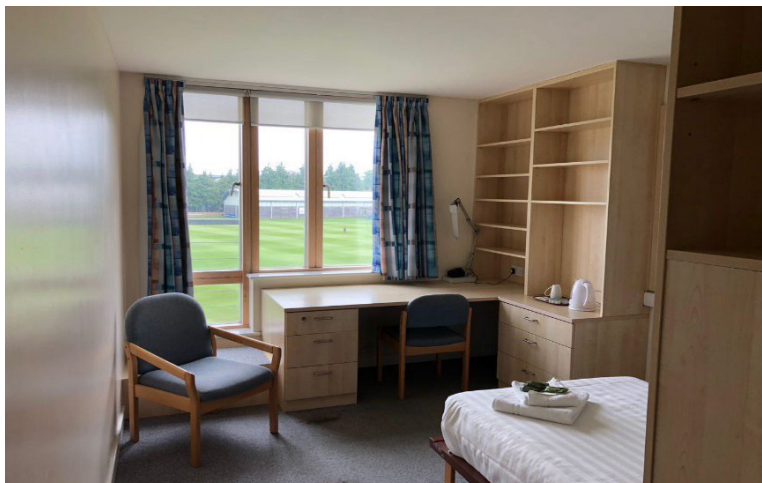
A study bedroom in the Fenner's Building (on-site band B)