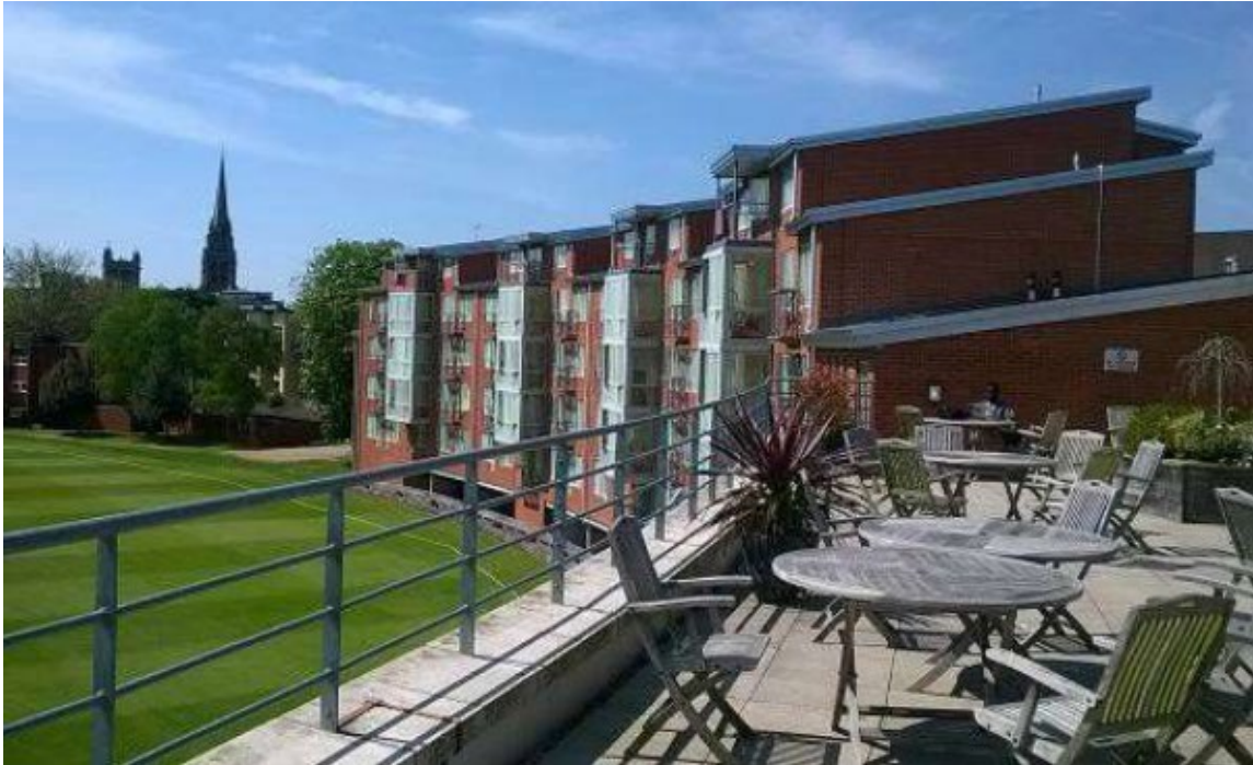
Fenner's Building's west front, view from the upper terrace

73 single rooms and 5 larger couples' flats in a recent building (2005) located just adjacent to the College's main gate. All single rooms are en-suite and overlook Fenner's cricket field. This building also includes 1 of the College's accessible rooms and 3 larger, more spacious rooms with a wet room in each. There is a laundry room within the building and several well-equipped shared kitchen-sitting rooms on each floor. Fenner's Building also has two roof terraces with views over the cricket field and towards the west and two of the College's main event and social spaces: the Dining Hall, and the Peter Richards Room. (All single rooms are 'on-site band B' plus 'on-site flat couples' accommodation'.)