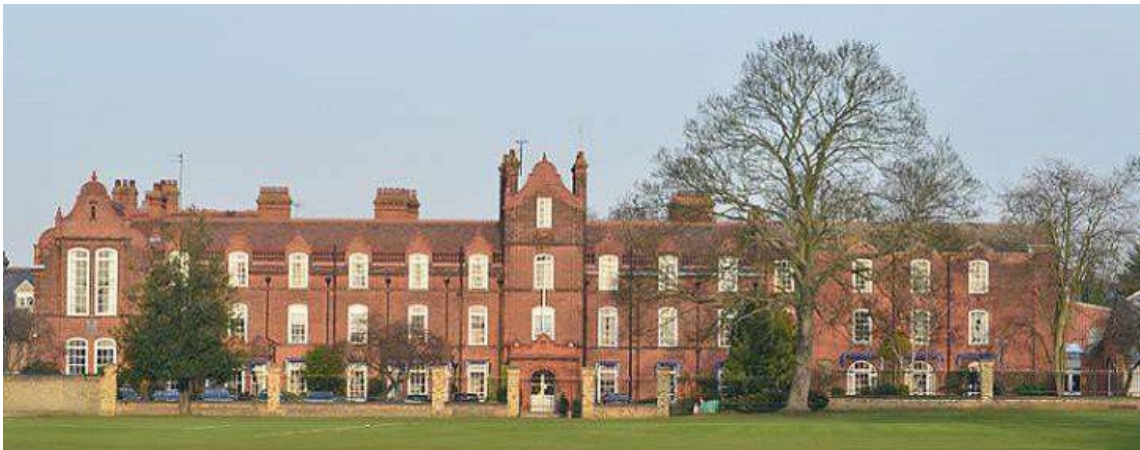
Wileman Building's west front; view from Gresham Court

The College has 392 rooms available to students to rent, 269 rooms are in 6 buildings making up the central college site surrounding the cricket field, and a further 123 are in houses owned or managed by the College and located in the residential streets in the local area, within a short walk of the College. Please note that details of rooms and policies are updated regularly and may change year-to-year.