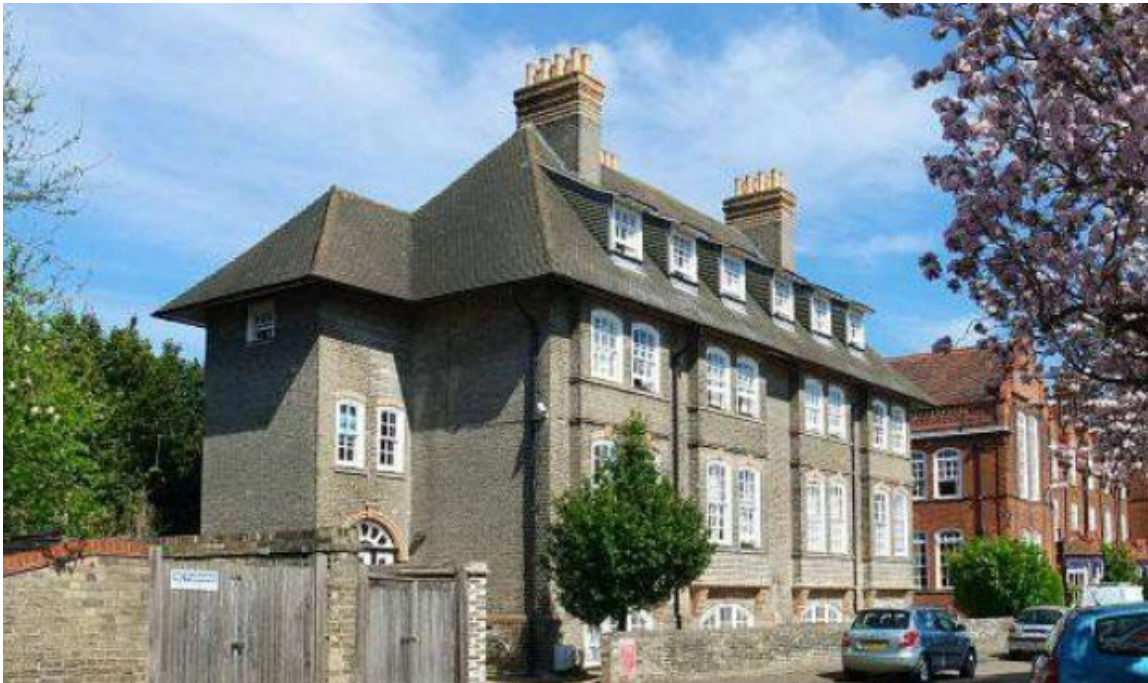
Wollaston Lodge's west front, view from the drive

24 rooms in a pair of attractive symmetrical Arts & Crafts style buildings (probably 1880s), located on the main drive next-door to the Wileman Building. A mix of large and small rooms, some en-suite. There is a large communal kitchen in the basement of each building. (A mix of 'onsite bands A, C, and D'.)