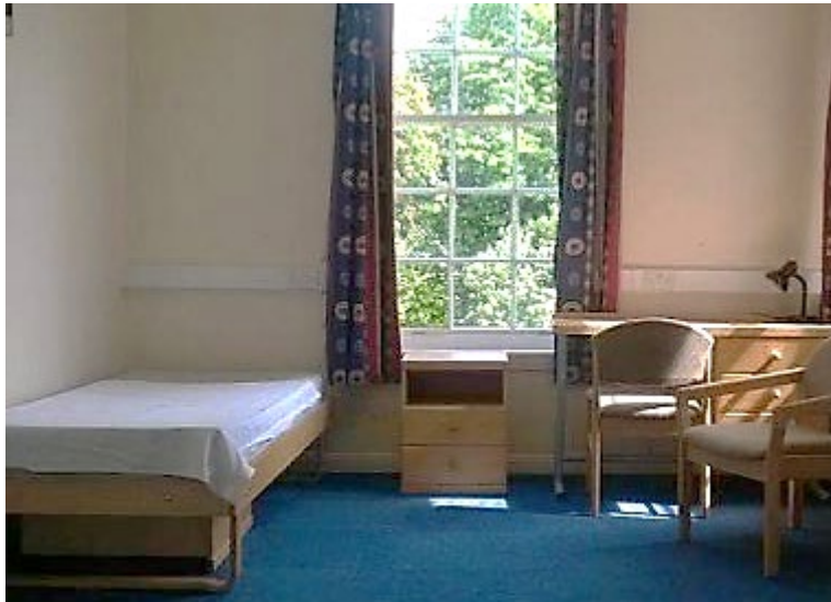
A room in the Margaret Wileman Building (on-site band C)