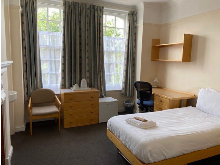
A room in the Wollaston Lodge