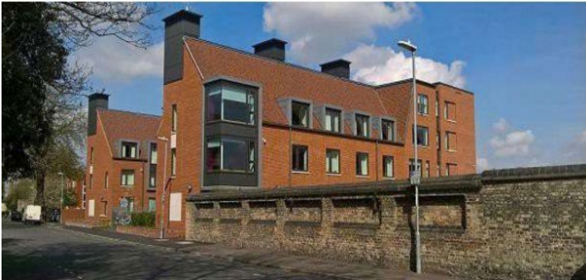
Gresham Court, view from Gresham Road

Several rooms overlook the University's cricket field (Fenner's), the University's lawn tennis courts, courtyard gardens, and Gresham Road. The building has several large, shared kitchen- sitting rooms on each floor, a large study-meeting space on the ground floor, and a dedicated laundry facility. This accommodation meets some of the highest standards for the University's accommodation in Cambridge. (All rooms are 'onsite band A'.)