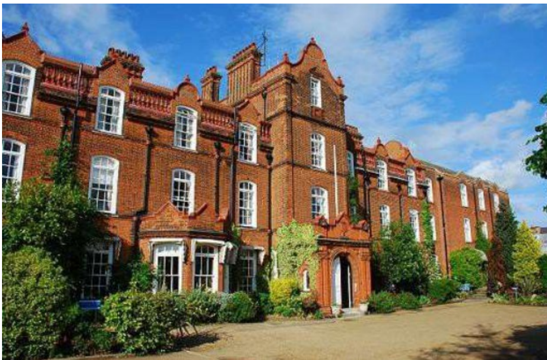
Margaret Wileman Building, view from the drive

23 single rooms in a grand building constructed for the College in the 1890s (now listed Grade II), with some more modern additions. There are shared kitchen/dining rooms and shared bathroom facilities available on each floor. The Margaret Wileman Building also contains the College Library, the main administrative offices for the College, meeting and seminar spaces, the MCR clubroom/bar, laundry room, and other student social rooms and shared facilities. (Most rooms are 'on-site band C', some smaller rooms are 'on-site band D'.)