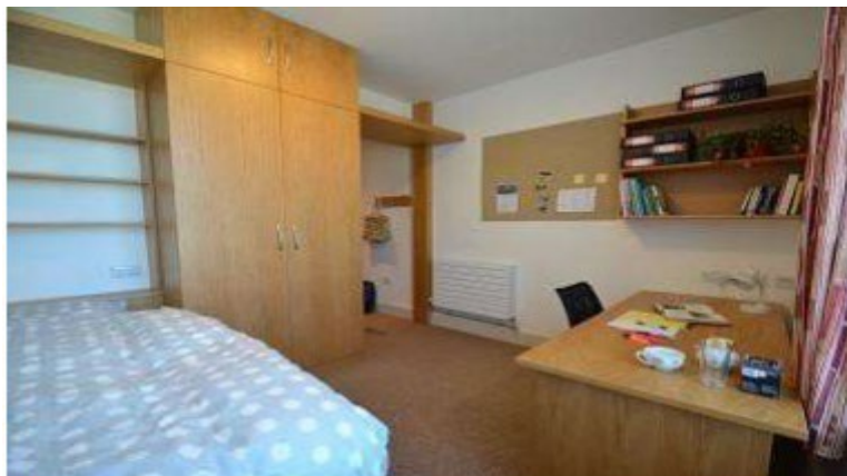
A study bedroom in Gresham Court (on-site band A)