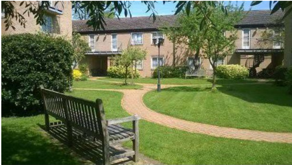
Chancellor's Court; view from the rear of Wollaston